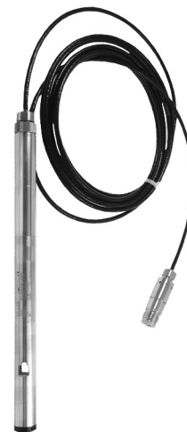
DCX-22 SG CTD DCX-22 VG CTD