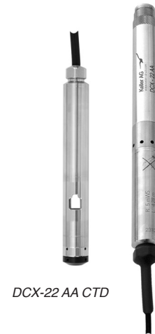
DCX-22 AA CTD

The DCX-22 SG/VG CTD versions have a cable outlet, negating the need to withdraw the instrument from the immersion tube in order to read out the data. A locking disc is used to secure the interface connector at the surface. In the VG version (reference pressure measurement), the reference equalisation capillary tube in the cable is inserted into the upper housing (read-out connector), where the reference opening protected by a Gore-Tex® diaphragm is located.