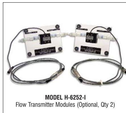
MODEL H-6252-I Flow Transmitter Modules (Optional, Qty 2)

The Computer Data Logging National Instruments I/O Module Option consists of interface components, power supply and converters to process seven thermocouples and two 4-20mA inputs directly to the RS-232 serial port of your IBM compatible desktop or lap-top computer (computer not supplied) via RS-232 interface cable. Templates for LabVIEW® control software are included.