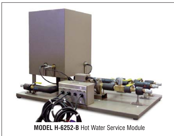
MODEL H-6252-B Hot Water Service Module