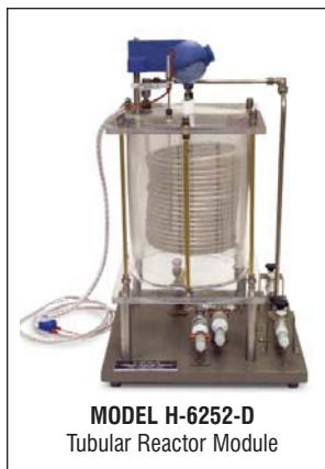
MODEL H-6252-D Tubular Reactor Module