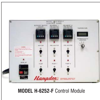
MODEL H-6252-F Control Module