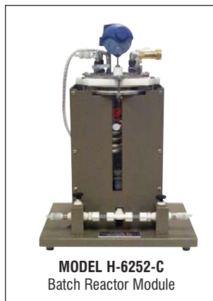
MODEL H-6252-C Batch Reactor Module

The variable speed allows experiments to be performed studying the effects of reagent mixing.