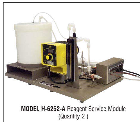
MODEL H-6252-A Reagent Service Module (Quantity 2)