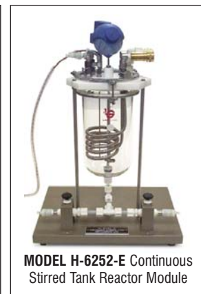
MODEL H-6252-E Continuous Stirred Tank Reactor Module