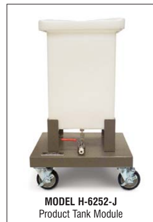
MODEL H-6252-J Product Tank Module

All Hampden units are available for operation at any voltage or frequency