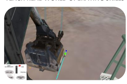
Controlling the dipper by following a straight-line trajectory