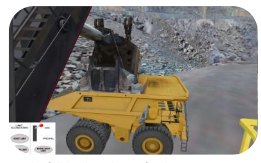
Positioning under full-load conditions for dumping into a Mining Truck