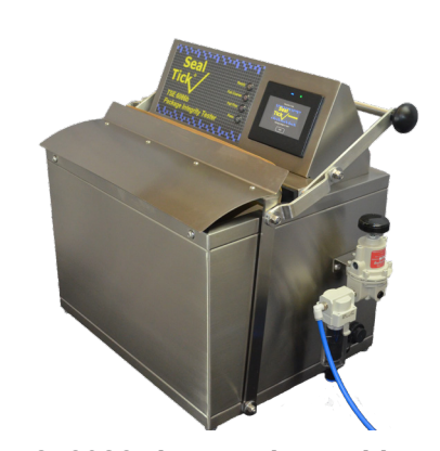
TSE6086b in operating position