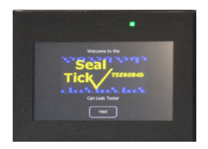
New Easy-to-Use Touchscreen Interface