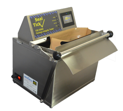
TSE6086b in open position, ready for next package to be loaded

All specsifications subject to change without notice