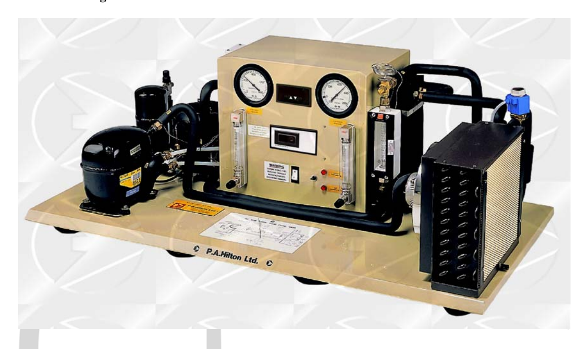
Figure 1: R833