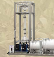
Model H-6150-TT Liquid-to-Liquid Extraction Demonstrator option

The Hampden Model H-ETS-1A Ethanol Production Process System is designed to facilitate the instruction of students on the process required to produce ethanol for experimental purposes. Ethanol is a very promising fuel alternative to oil since sources are widely available and ethanol is clean-burning. The student will be able to observe and control the process of producing ethanol from corn, sugar, sorghum, fruits or several other sources. When using this unit along with the Model H-6150-TT Liquid-to-Liquid Extraction Demonstrator option, it is possible to produce ethanol with high purity.