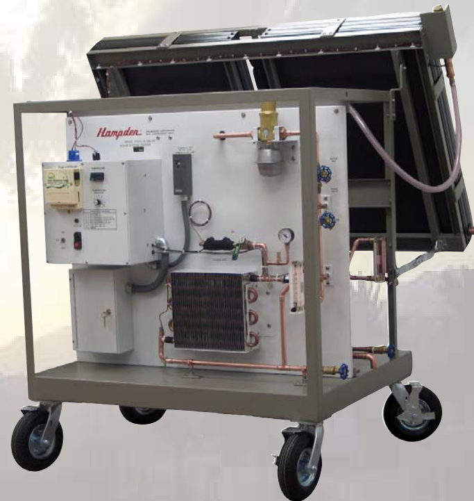
Model H-SST-1A Shown with CDL Computer Data Logging Package and FP Fault Package Options

Gauges, thermometers, and flowmeters permit students to observe pressures, temperatures, and flow rate while the system is in operation. The trainer is mounted on a mobile frame and the collector panel is adjustable for easy positioning in direct sunlight.